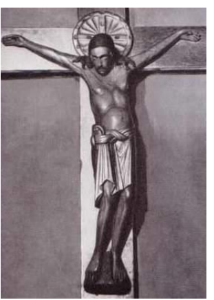
15) Ок. 970 г., Кельн