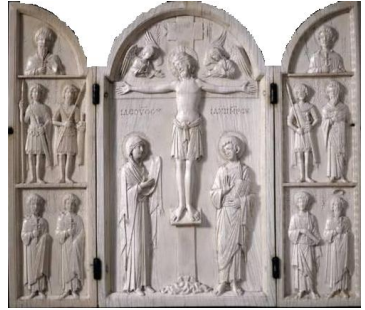
10) XIV в., Триптих, Византия