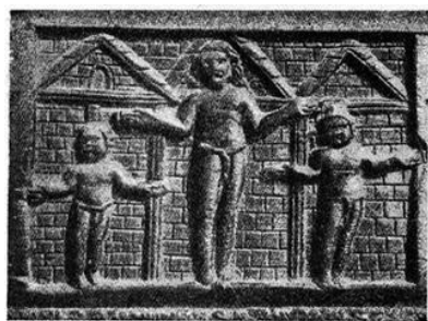
3) V в., врата церкви Сабины в Риме