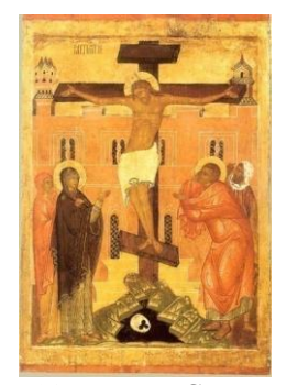
20) XVI в., Соловки