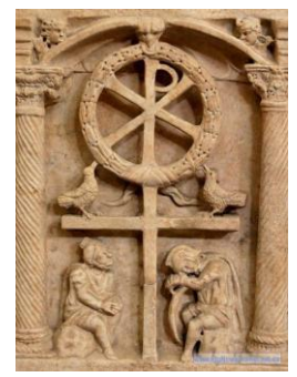
2) Латеранский саркофаг из церкви св.Павла