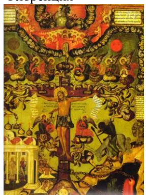
24) 1689 г., «Плоды страданий Христовых», Соловки