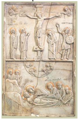
11) XII в., Византия