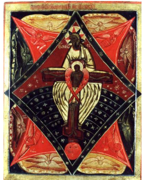
21) XVII в., Христос в лоне Отца