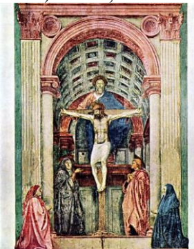
22) 1425 г., Мазаччо, Флоренция