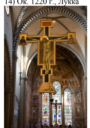
16) XIV в., Джотто, Санта Мария Новелла