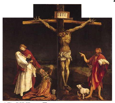
17) XVI в., Грюневальд