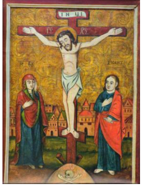
23) XVII в., Минск