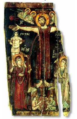
9) VIII в., Синайский монастырь