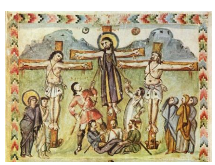
6) VI в., Евангелие Раввулы