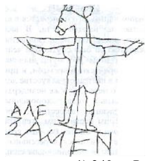
1) 240 г., Рим