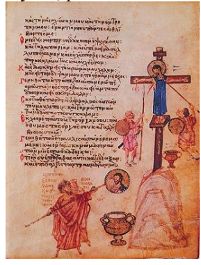
7) IX в., Псалтирь Лобкова (Хлудовская)