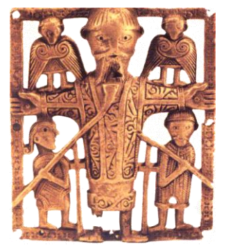
13) Ок. 800 г., Дублин