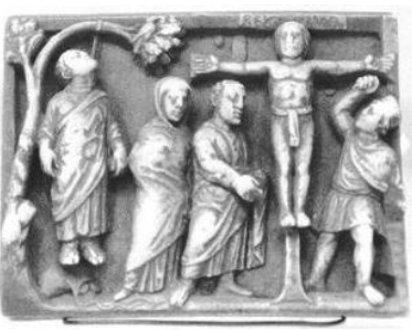
4) V в., Британский музей, резьба по кости