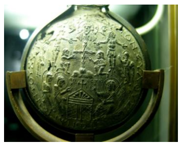
8) VI в., ампулы Монцы